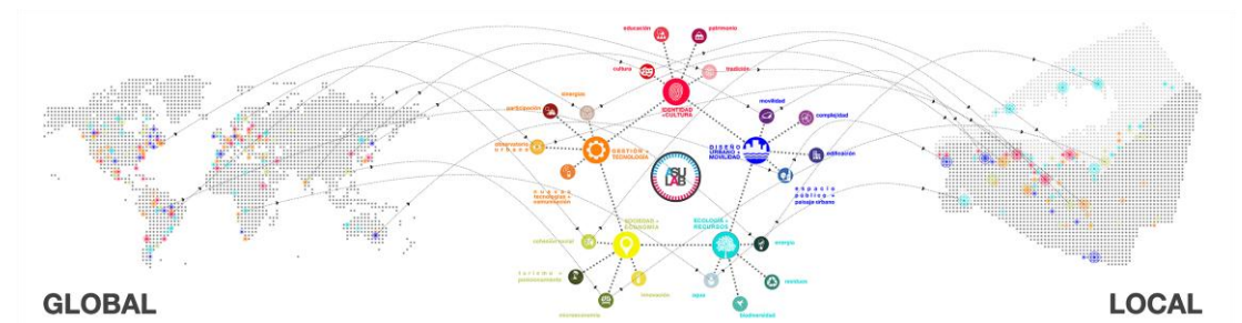
Fig.1. Representation of the contemporary connections between the global and local.

In essence, today the planning seems to be working primarily through the identification of future scenarios and strategies operational times not to determine, but to coordinate a set of projects and actions of intervention on the cities and territories.